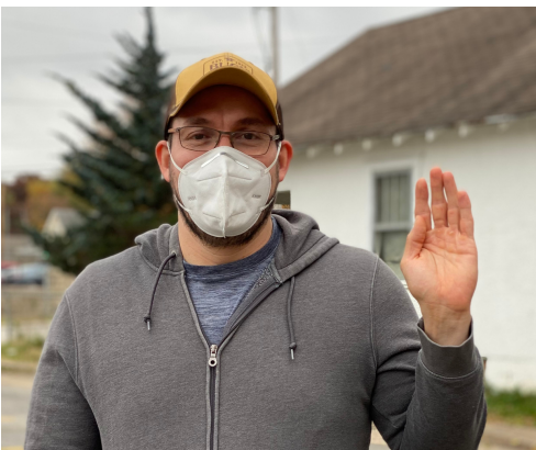
NEIGHBOR & ADVENTURE ACADEMY [AFTER SCHOOL PROGRAM] PARENT

"The Hub means a lot to me because the Adventure Academy is like a second school for my daughters. Being a part of The Hub helps my kids grow and know what is like to be a part of the community by helping others. This community is building my daughters and making them better people. And, the Hub is a part of our family now!"