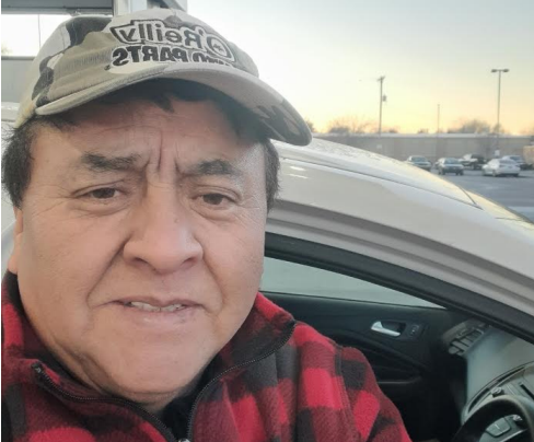
NEIGHBOR & COMMUNITY MARKET VOLUNTEER